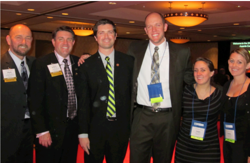
WesternU students pose for a photo with two trustees members from The Academy of General Dentistry